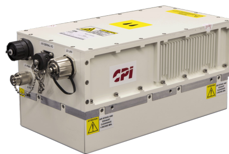
CPI GaNLink™ 80 W Ka-band GaN SSPA / BUC, Model SA49KOA / SB49KOA

Backed by over 40 years of satellite communications experience, and CPI's worldwide 24-hour customer support network that includes more than 20 regional factory service centers.